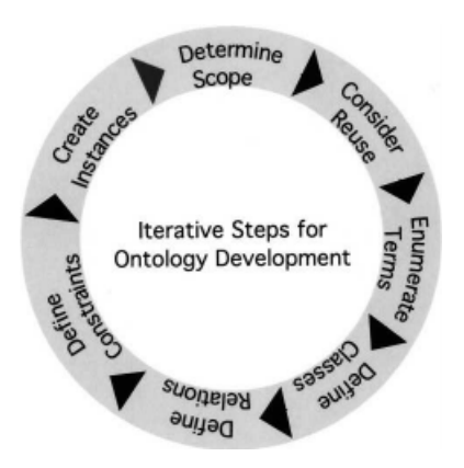
Figure 1: Classic ontology development lifecycle (Noy and McGuinness, 2001)

glossaries. When compared, they may have apparently incompatible conceptualizations within the specified scope or universe of discourse.